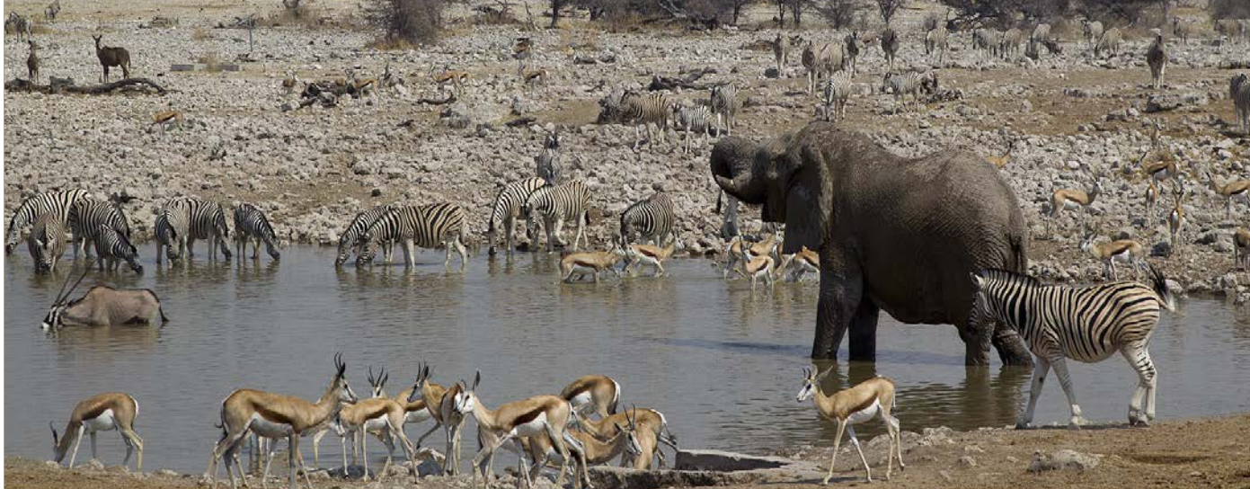
PHOTO CREDIT: BLACK RHONO AT ONGAVA BY MIKE MYERS; ETOSHA WATERHOLE