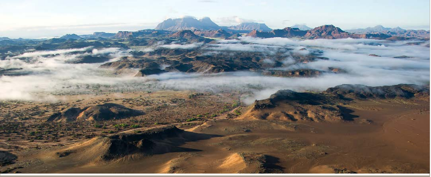
PHOTO CREDIT: HARTMANN'S MOUNTAIN ZEBRA BY SIMON BELLINGHAM; DAMARALAND LANDSCAPE BY DAMARALAND CAMF